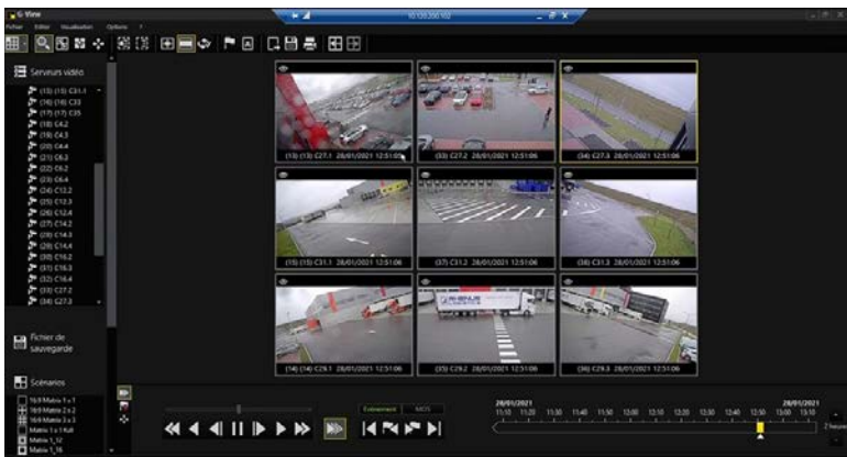
The intelligent risk management from Primion.