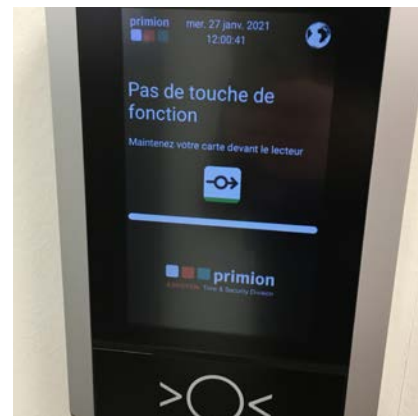
Time & Attendance Terminal ADT 1110.