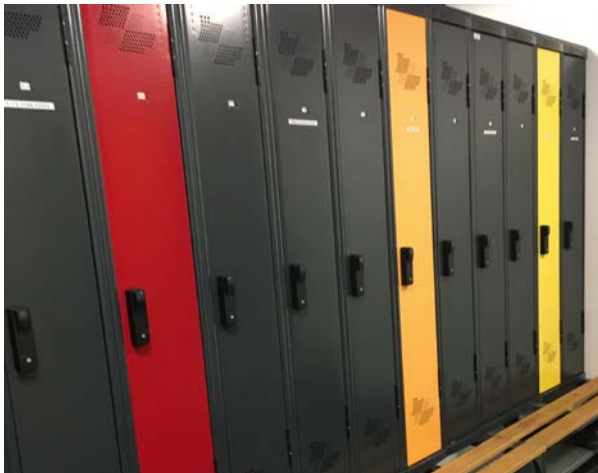
The changing rooms with pKT cabinet locks.